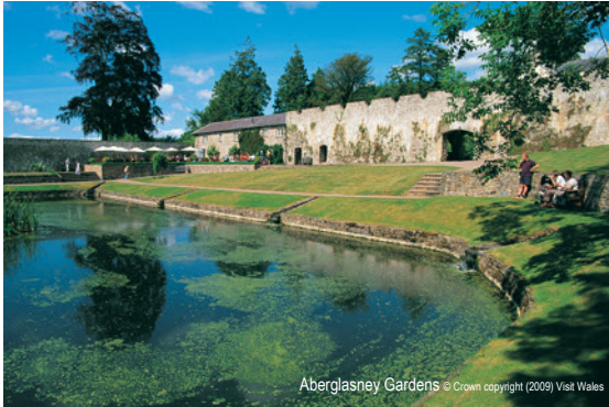
Aberglasney Gardens

Wednesday 8th September Today we visit a garden of great horticultural and historical importance - Aberglasney - a garden lost in time (seen in the BBC series), where the garden restoration is continuing in the time honoured way, improving, upgrading, restoring and replanting. We return via the historic market town of Carmarthen where we shall have some time to explore.