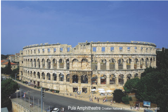
Pula Amphitheatre

monastery, see the city of Krk and Vrbnik, most famous for its white wine - Vrbnicka žlahtina.